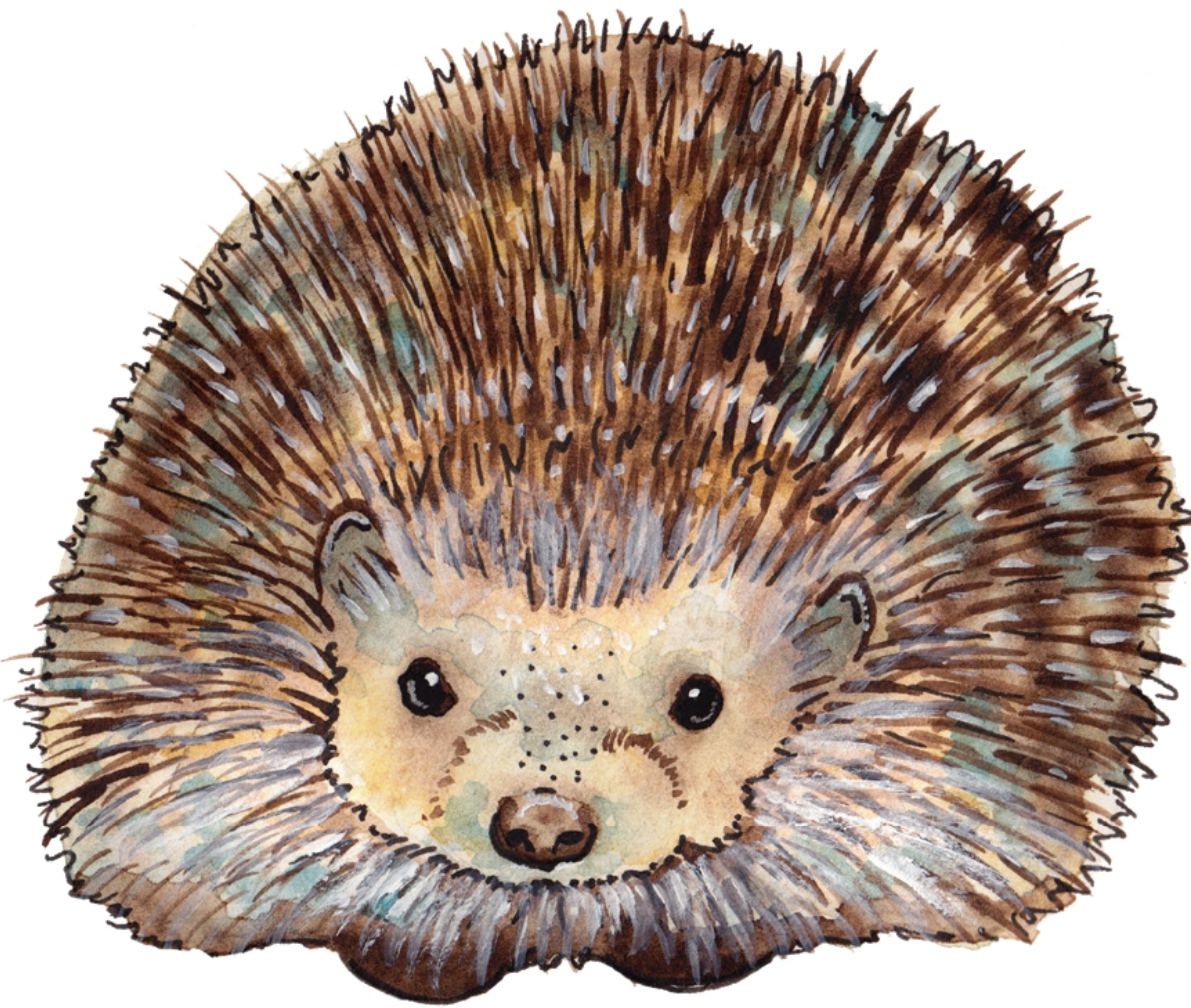
Illustration © Ceri Thomas 2018

1. Draw a nest for this hedgehog to hibernate in. Why not stick on some leaves too!