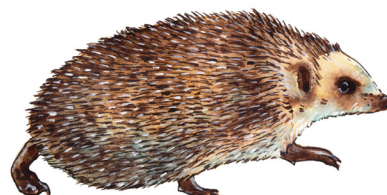
Illustration © Ceri Thomas 2019