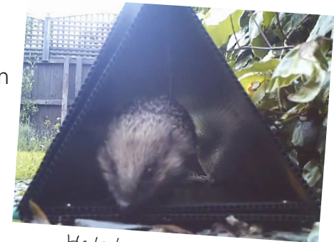
Hedgehog in tunnel, 2016

Leave the tunnel overnight and return to check it in the morning. Take out the tracking plate, remove the paper and replace it with fresh sheets. Replenish the supply of food.