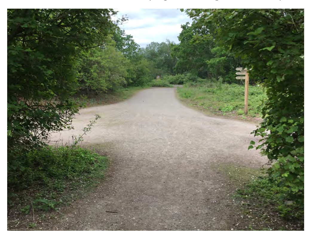
If you hear an alarm and your leaders doesn't do anything do not worry, It is from the factory and won't affect us.

When we reach a crossroads, we will stop and make sure there are no cars before carrying on, taking the middle path.