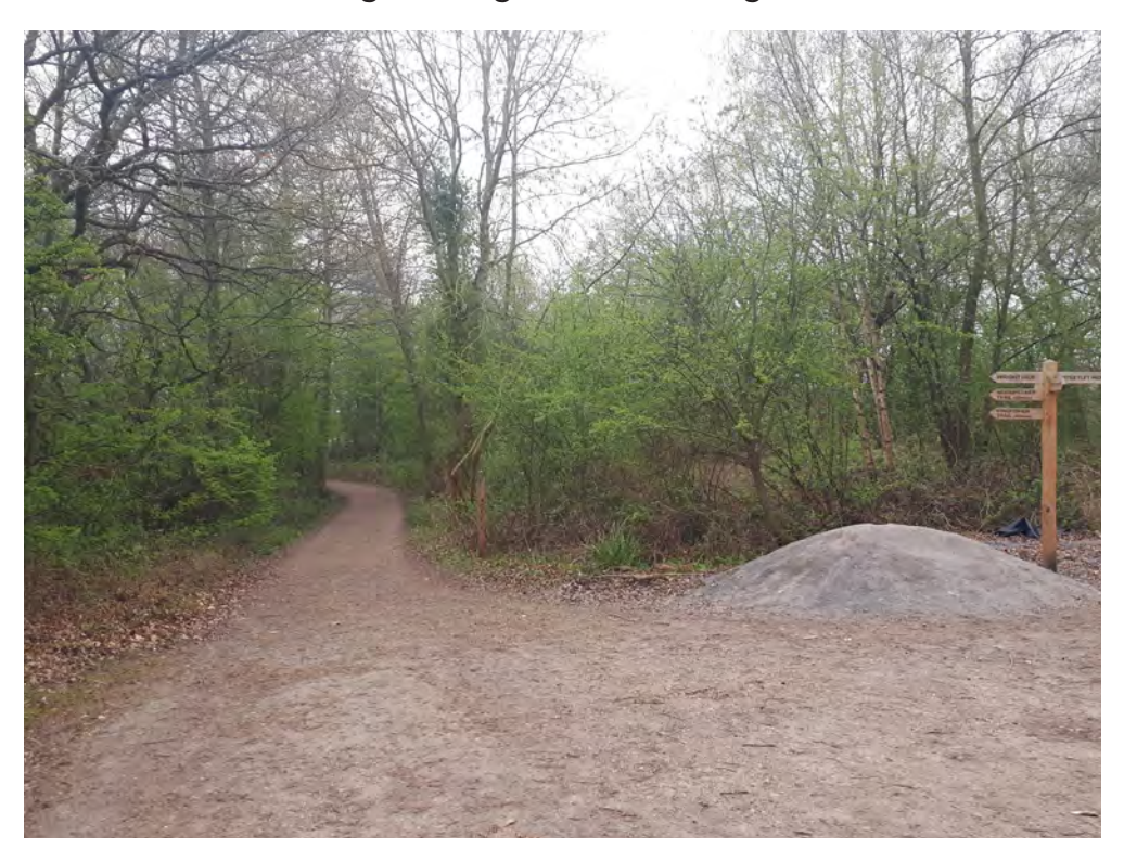
You may see on the path some shiny freshwater mussel shells, broken by otters looking for food!

At the signpost we will then take a path to the left, following the sign for the Wright Hide.