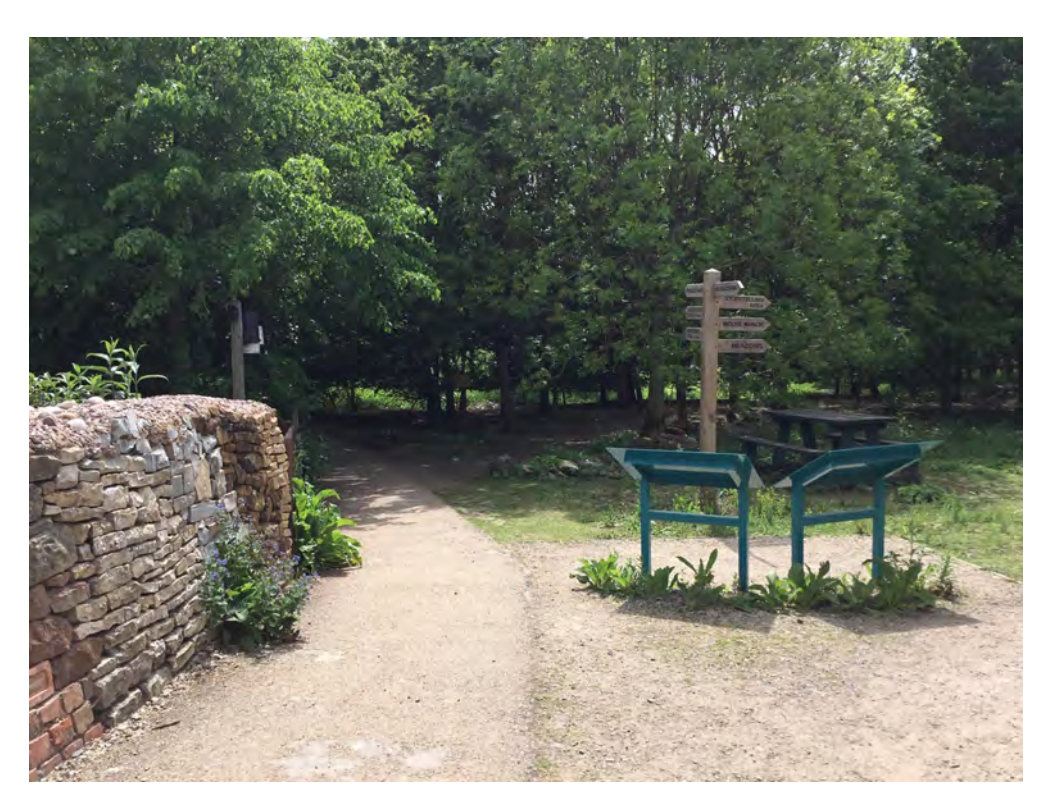
We will follow this path to get to the bird hide. On the way you may spot a map of Brandon Marsh.

If you are doing a bird watching activity, we will go on a 10-minute walk to a bird hide - a small shelter overlooking a lake, where we can look for birds with binoculars.