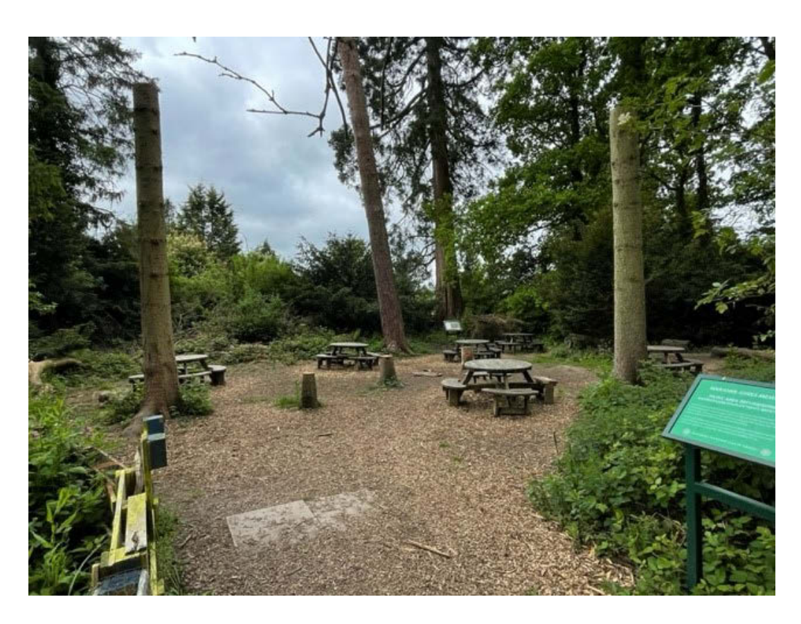
You may play in our courtyard if you have time at lunch.

At lunch time you will eat lunch in the classroom or maybe outside in the picnic area if the weather is good.